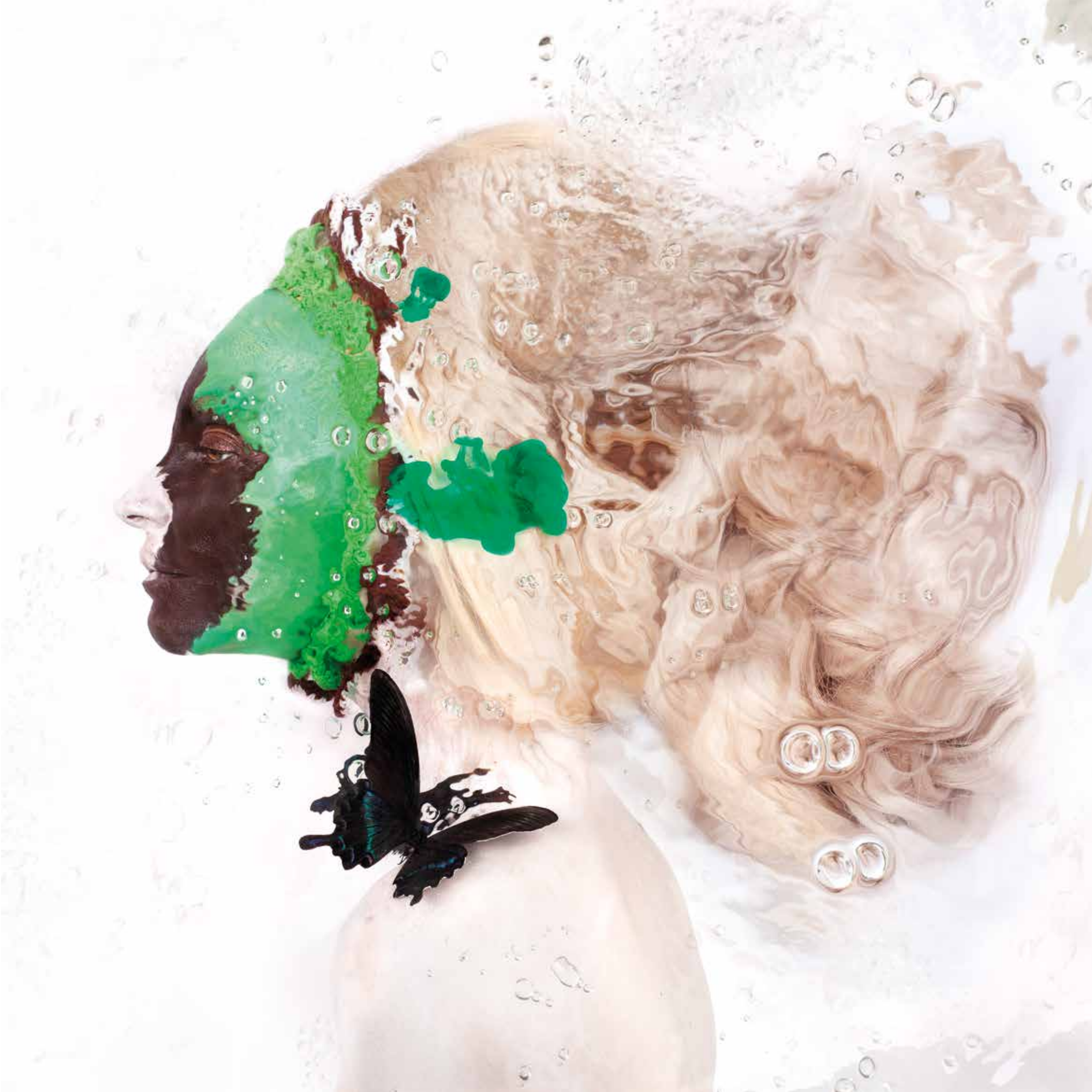
Little Green 2021